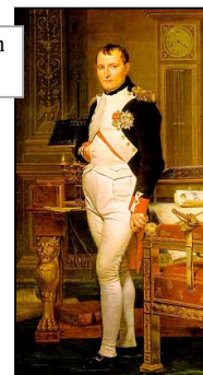
Napoleon in his Study

Battle of Trafalgar British defeat of Napoleon’s forces at sea