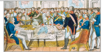
The Congress of Vienna

The Congress of Vienna created very successful peace agreements. None of the great powers fought against one another 40 years. Some did not fight in a war for the rest of the century. 1. What three goals did Metternich have?