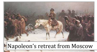
Napoleon's retreat from Moscow

Hundred Days Napoleon's last bid for power, which ended at Waterloo