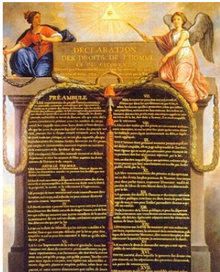
Declaration of the Rights of Man

In August 1789, the National Assembly took steps to change France. It made a revolutionary statement called the Declaration of the Rights of Man . One new law ended all the special rights that members of the First and Second Estates had enjoyed. Another law gave all French men equal rights. Though women did not get these rights, it was a bold step. Other laws gave the state power over the Catholic Church.